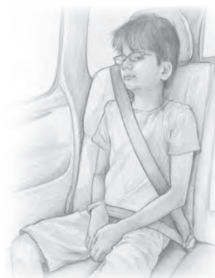
FIGURE 6. Lap and shoulder seat belt.