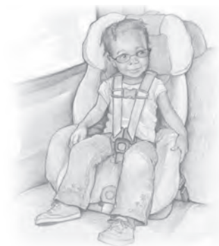
FIGURE 4. Forward-facing car safety seat with harness.