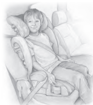
FIGURE 5. Belt-positioning booster seat.